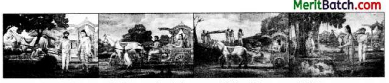
(1) He laughed.

(A) Choose the picture that expresses the true emotions of the Prince when he sees the outside world: